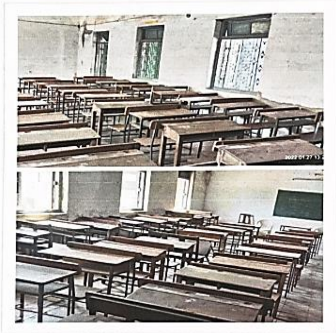
Classrooms having proper ventilation and illumination.