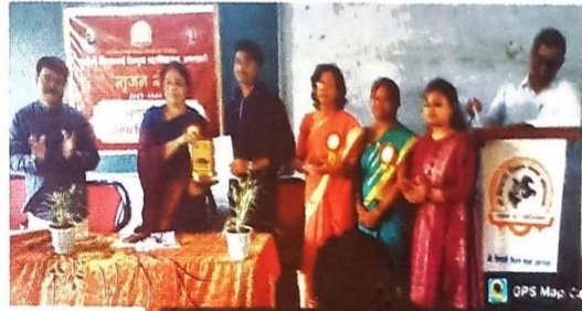
Amravati, Maharashtra, India WORS+W45, Rampuri Camp, Amravati, Maharashtra 444601, India Lat 20.942212° Long 77.767967°